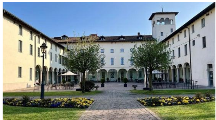
Grand Hotel Villa Torretta